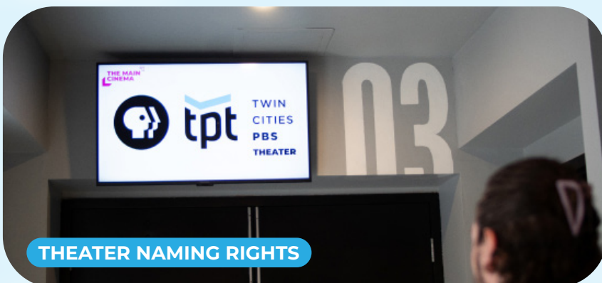
THEATER NAMING RIGHTS